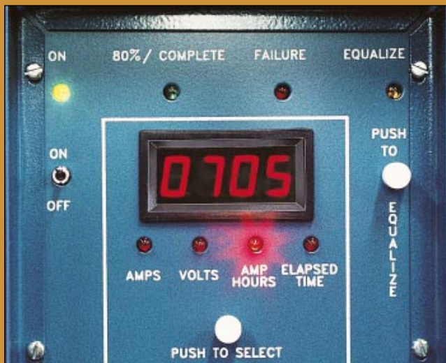
Ampere Hours Returned —displays accumulated amp hours returned to the battery during this charge cycle.

The A70B Charger gives you all the up-to-date status information you need, when you need it. A manual Push-to-Select button allows you to scan each of four critical operating parameters shown on a large \frac{1}{2} " LED digital display. In case of an input power loss, the LaMarche A70B Charger retains all the vital information in its computer memory.