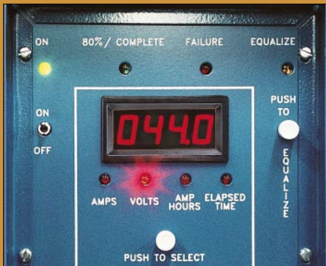
Output Voltage —displays actual voltage of a battery \pm 0.1 volt.