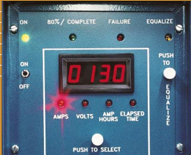
Output Amperes —displays actual output current within \pm 1 amp.