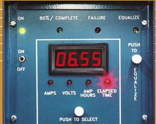
Elapsed Time —directly readable in hours and minutes.