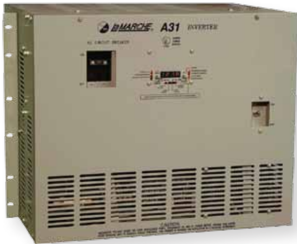
Unit shown with optional 1ms Static Transfer Switch & Digital Display