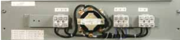
*Back Cover Not Shown