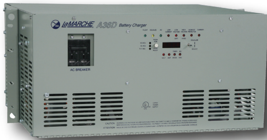
Unit Shown with LED Display