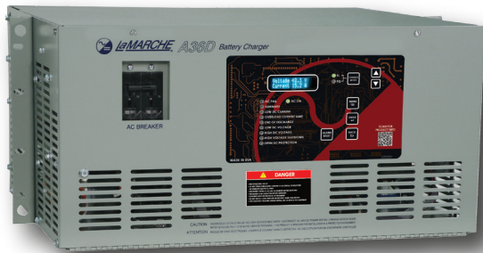
Unit Shown with VFD Display