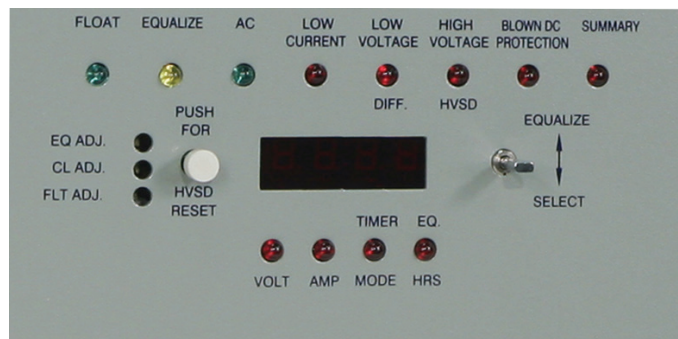
Standard LED Display